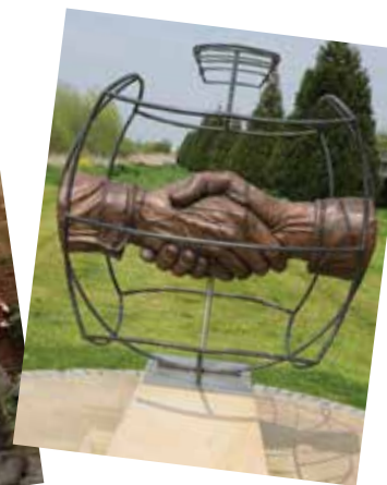
Christmas Truce 1914 Football Remembers memorial at the National Memorial Arboretum, Arlewas, Staffordshire, England.

for participating. Yet it is believed that about two-thirds of the troops along the line did take part in what came to be called the Christmas Truce.