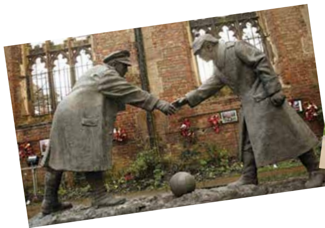
A Christmas Truce statue inspired by The Farm's WWI song, All Together Now , originally produced in fiberglass, toured many locations before being cast in bronze.

The fighting did not cease completely. In some places a truce was attempted but the firing continued. Some soldiers were punished