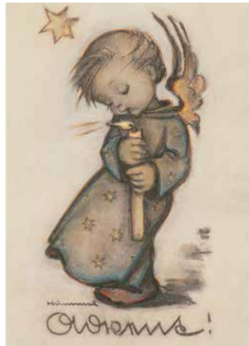
Heavenly Angel – Adventsengel, 1929, pastels, 15.50" x 22.50", H425

The New Testament outlines a celestial hierarchy of nine choirs of angels divided into three groups: Angels, Archangels, Principalities; Powers, Virtues, Dominions;