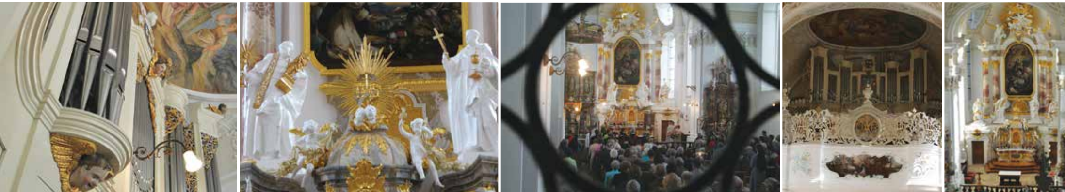
Left to right: detail, Walcker organ; detail of the high altar; view from the winter choir to a service in the nave; view to the cloister choirs and Walcker organ; high altar

Johann Baptist Zimmermann was acclaimed for his frescos in numerous Baroque structures including the ceiling fresco in the iconic St. Peter's Church in Munich, and the central pavilion of the opulent Nymphenburg Palace.