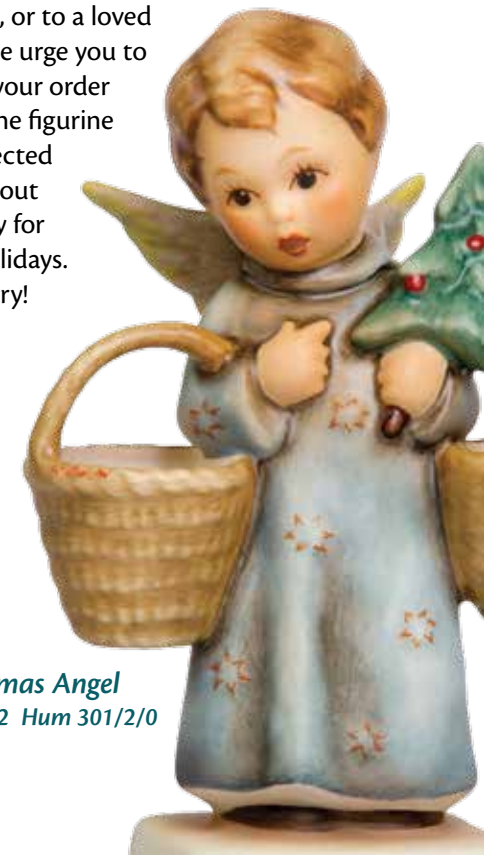
Christmas Angel 1000502 Hum 301/2/0 3.50"

This year marks another change, quite a colorful one, in fact. Christmas Angel is now available in a European Variation with a blue robe instead of the classic green. If this color scheme appeals to you, or to a loved one, we urge you to place your order fast. The figurine is expected to sell out quickly for the holidays. So hurry!