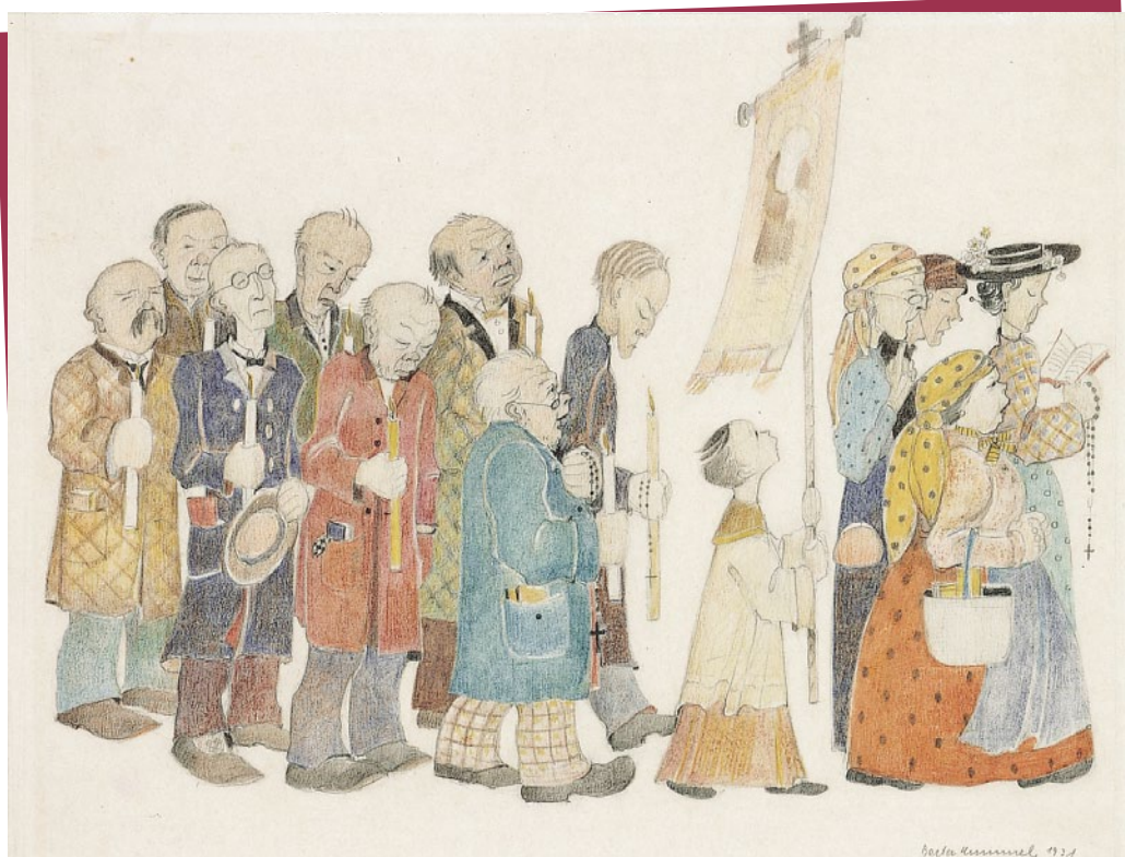
Corpus Christi procession in Massing, 1931, colored pencil and lead pencil, 210 x 220 mm