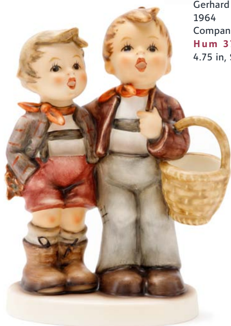
Gerhard Skrobek 1964 Companions Hum 370 4.75 in, $ 385